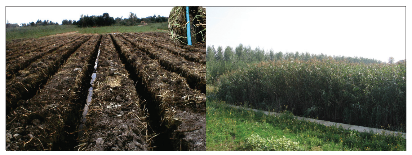
Fig. 2. CWS in construction (2004) and after several years of operation

CWS and the discharge of the purified water into a channel which empties into the Danube (Belić et al., 2004).